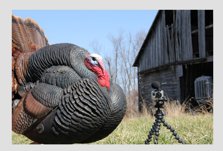
Live on YouTube